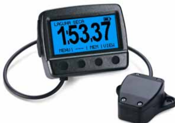
Figure 1: MyChron Light TG and its IR receiver