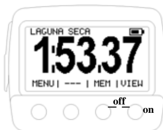
Figure 2: MyChron Light TG display

First of all, please switch on MyChron Light TG pressing the right rubber pushbutton (to switch it off You have to press the two right rubber pushbuttons). All digit numbers are set to zero. In order to get correct data from Your lap timer, You have to configure it. To start configuration, please press MENU pushbutton: configuration menu is displayed. For further information concerning all configurable functions, please refer to the following table: